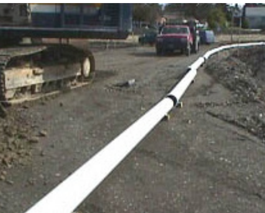
Harbour Island, Seattle, pipe coated in PPA 571