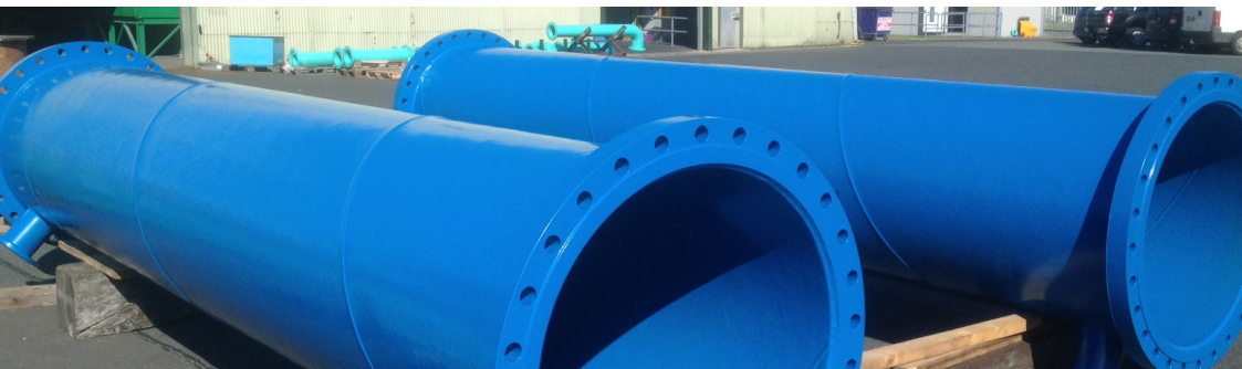
Water distribution pipes coated in PPA 571 Aqua

Over 5700 linear metres of redesigned and relocated distribution water mains pipe work for the extended Port of Seattle was coated in Plascoat PPA 571 . The benefits achieved by Seattle Public Utilities include superior protection against corrosion, ease of handling and long term cost savings through longevity in terms of pipeline life-time and minimal maintenance costs.