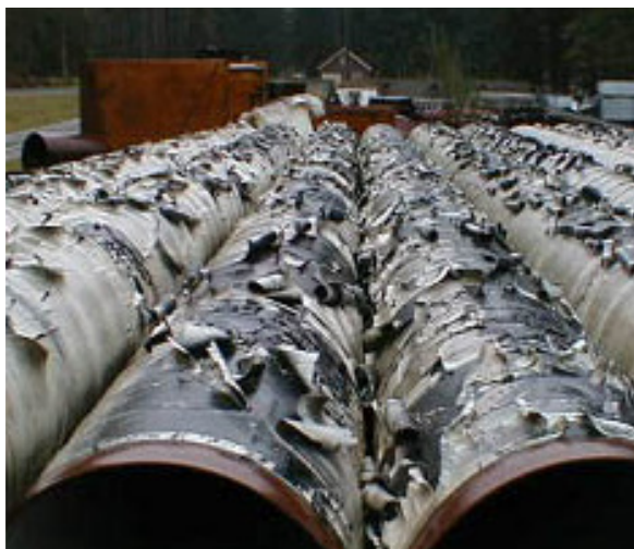
In other areas the polyethylene tape has flaked and peeled