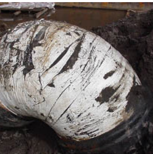
The polyethylene tape has wrinkled and split