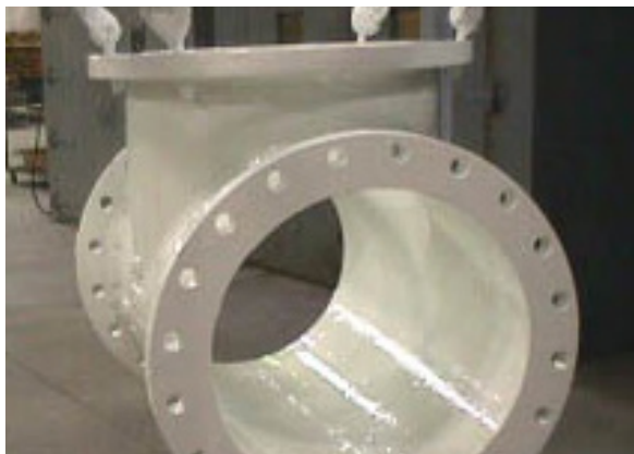
Pipe fitting coated in PPA 571